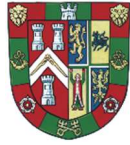
Province of Northamptonshire & Huntingdonshire