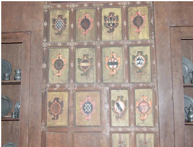
Typical painted wall in the Winter Parlour

This is all speculation and to discover the facts we need to identify and de-cipher the meaning of the lower row of the crests. This proved difficult, as they did not seem to match any crests depicted in local or national archives. The top rows are documented as belonging to local families such as in the picture below from the Winter Parlour