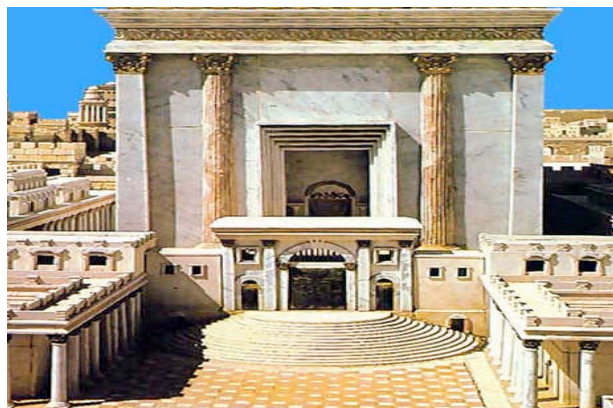
The entrance to King Solomon's Temple its similarity to the design of the buffet is remarkable

The writing on the scroll on both sides of the buffet has been erased, yet the compasses are in excellent condition for their age. The setsquares are clearly seen in the left hand picture. They surmount two columns again a possible Masonic connection? The V&A Conservator identified