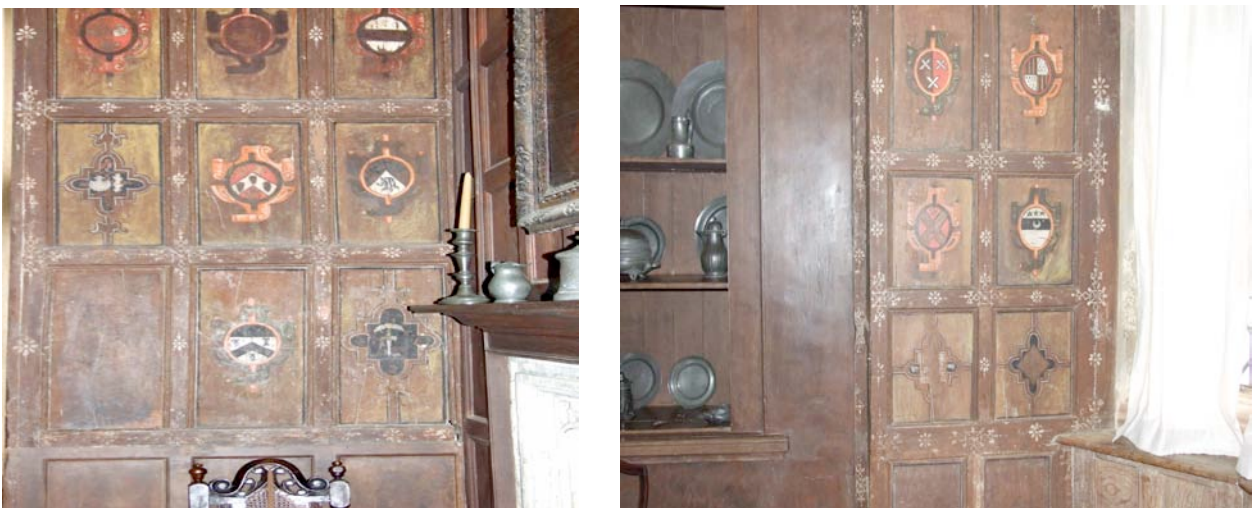
Another wall depicting Masonic symbols

The Lion, which surmounts the red column, is the Holy Royal Arch symbol for Strength and Power, while the five arrows depict Balance and Harmony. The Boars Head on a cushion, no neck, symbolises courage, authority and antagonism. It can also represent Hospitality. It is interesting that the Boars Head with no neck is normally found in Scottish Heraldry with Scottish Speculative Masonry being established earlier than that in England this could be a significant link. There is also a set of scales often used in Craft ritual.