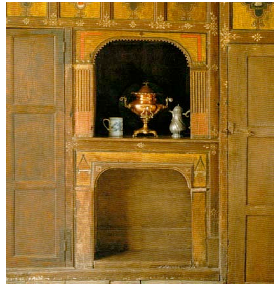
The Buffet with the Setsquares compasses and scrolls

The writing on the scroll on both sides of the buffet has been erased, yet the compasses are in excellent condition for their age. The setsquares are clearly seen in the left hand picture. They surmount two columns again a possible Masonic connection? The V&A Conservator identified