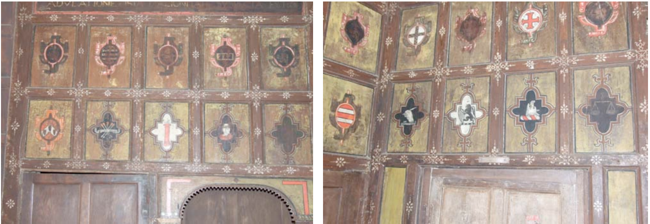
Two of the walls in the Winter Parlour showing the crests and the cupboard alongside the fireplace

given to me by the National Trust list many of the crests in this row as 'Unidentifiable' or 'Unknown' could these be a 'membership list, or Lodge symbols'?