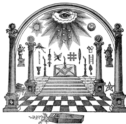
Original Masonic symbol of the all seeing eye

What is interesting in Masonic terms are the references to possible Masonic symbols. In the two pictures shown below, the inn in the picture on the right shows a sign of a Dragon, the first Northamptonshire Lodge formed in the 1750's was called the George and Dragon Lodge as it met in the George and Dragon public house. The one on the left shows the possible remains of an all seeing eye with a Hebrew sign for life (A symbol used in both Rose Croix and the Knight Templar Orders) Going through the centre with a wreath of clouds used in the Masonic symbol beneath.