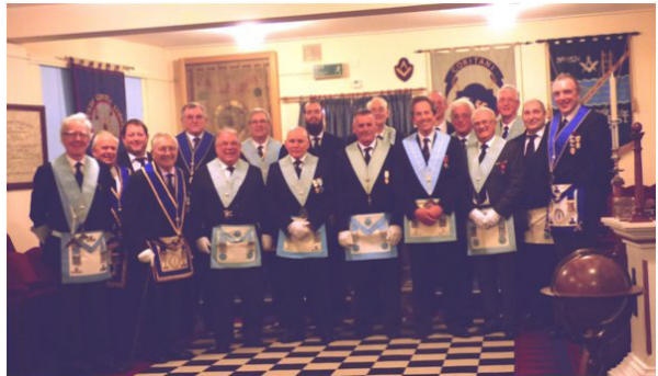
WM, Wardens, Officers and members of Beneventa Lodge.

The lodge name was taken from the early Roman settlement of Bannaventa, (According to the manuscript 'Roman d'Alexandre' in the Bodleian library to be the British home of St Patrick), at the North end of Borough Hill, on the outskirts of Daventry, which ultimately became the