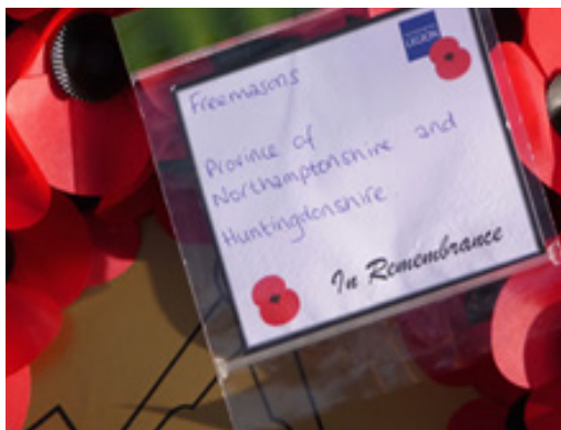
Wreath laid by the Provincial Grand Master