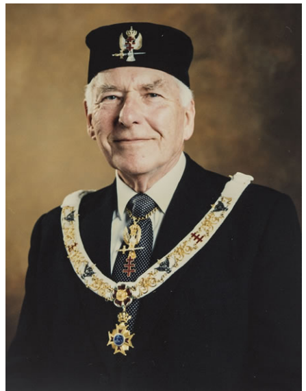
As MP Sovereign Grand Commander

He completed 60 years membership in the Craft and Holy Royal Arch. On 24 March this year he would have also done so in the Mark Degree.