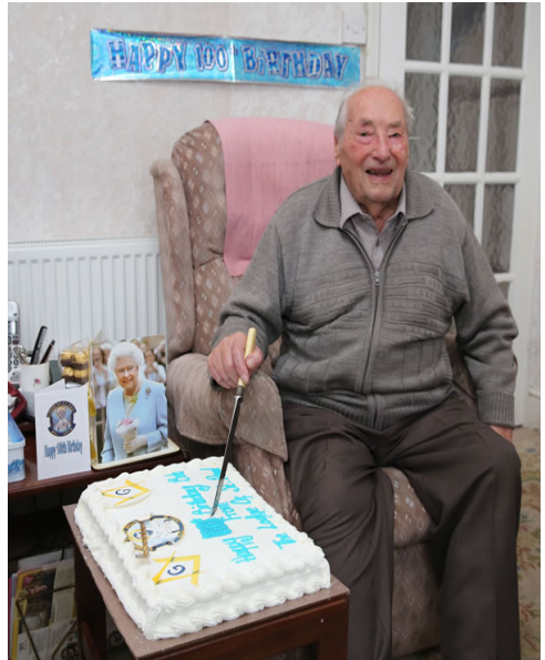
Message of congratulation from Her Majesty the Queen