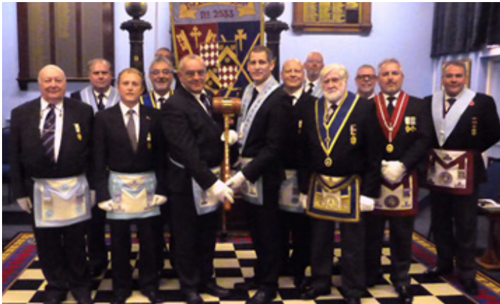
Members of Fitzwilliam Lodge with the Lactodorum Lodge raiding party

Consequently, Lactodorum Lodge members formed a very impressive party, led by their