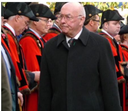
Provincial Grand Master at the Parade

The Last Post signalled the beginning of the two minutes silence. Reveille marked the conclusion. This was followed by the official ceremony of wreath laying when the Provincial Grand Master laid a wreath on behalf of the Province. The event was very well supported by the people of Northamptonshire.