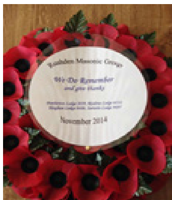
Right. Wreath laid at Rushden War Memorial by members of local Lodges