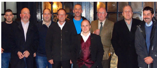
The New Mason group