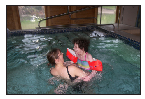
Hospice Hydrotherapy Pool

The East Anglian Children's Hospice at Milton, near Cambridge, provides much needed help and support to parents, children and their siblings in some of the most tragic circumstances imaginable - help not available through the NHS. The catchment area served so well by this Hospice covers much of the Northamptonshire and Huntingdonshire Masonic Province.