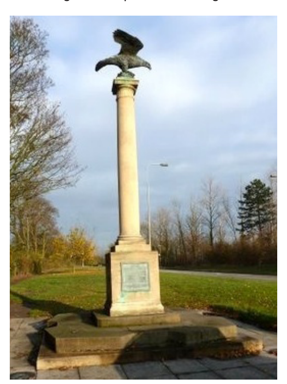
The memorial to the 1,770 prisoners who died at Norman Cross beside the A15 road

Parole was granted to prisoners who signed a document promising to observe certain rules