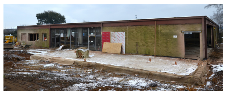
Foundation for kitchen