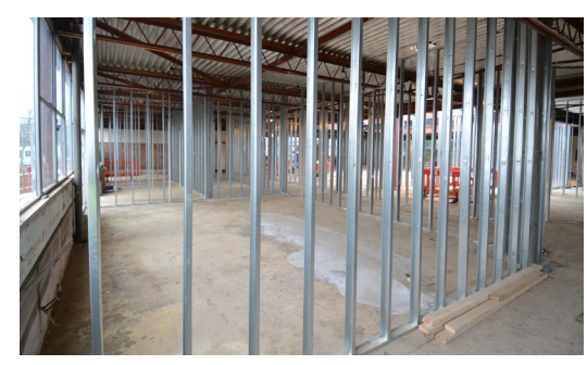
Offices to left of main entrance