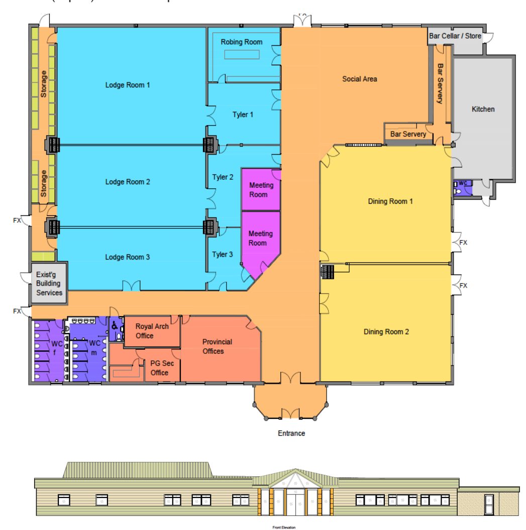
Front elevation of new Northampton Masonic Centre

Plans are well advanced for refurbishment at the site which is to be the new home for Freemasonry in Sheaf Close, Northampton. The plans have already been published and are shown (in part) below. The plans in more detail are featured on the Provincial website.