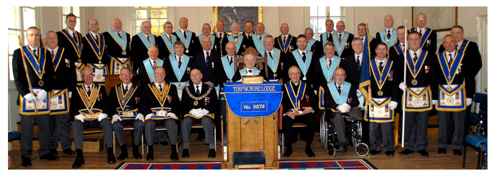
Lodge Founders with the Provincial Grand Master and his Consecration Team

The day was concluded with a Festive Board held in both rooms of Stamford Masonic Centre. This Lodge plans to meet at Stamford Masonic Centre on the fourth Tuesday of September, November, January and March, meeting in the mornings followed by lunch and all visitors will be most welcome.