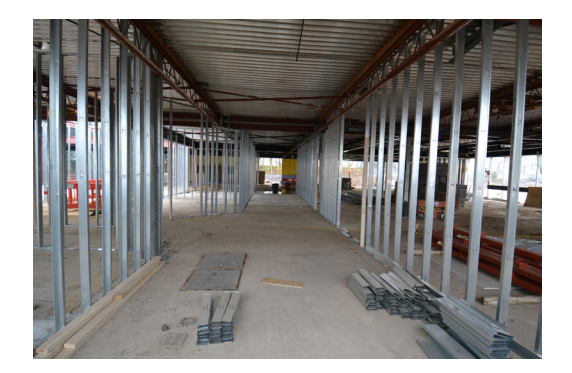
Main entrance with Provincial Office on left and dining rooms on right