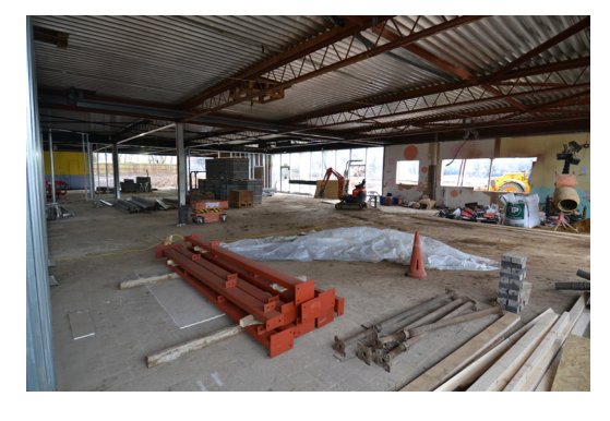
Dining rooms in foreground and social area in background