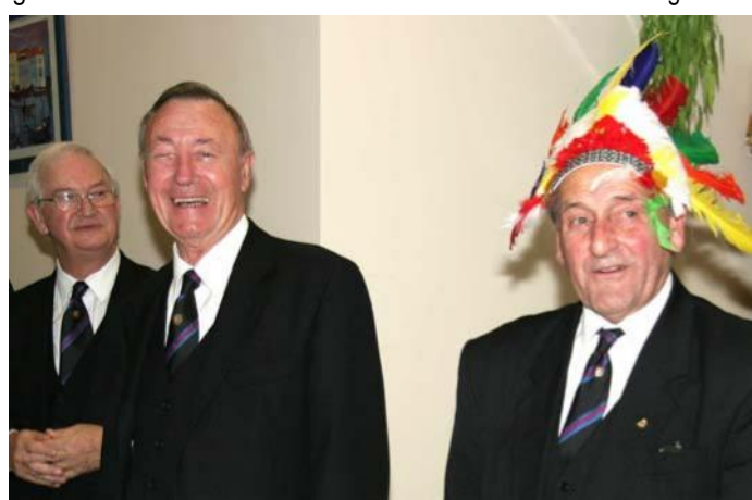
Those didn't look like Indian Scouts to me!

Trailed in the Winter 2005 edition of Password, the new Lodge, taking its name from an Indian word, was consecrated with great success at the Ellindon Masonic Centre Peterborough.